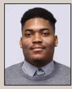
"COE gave me the chance to learn the scientific background of the poultry industry. I made lifelong friends during COE and my internship. The skills I learned are currently helping me build/develop a department from scratch."